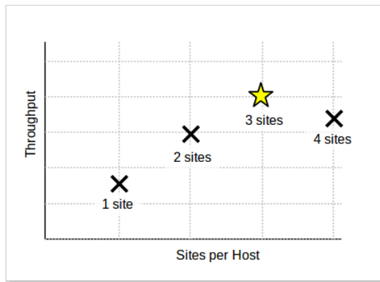
Figure 5.2. Determining Optimal Sites Per Host

By graphing the relationship between throughput and partitions using a benchmark application, it is possible to maximize database performance for the specific hardware configuration you will be using.